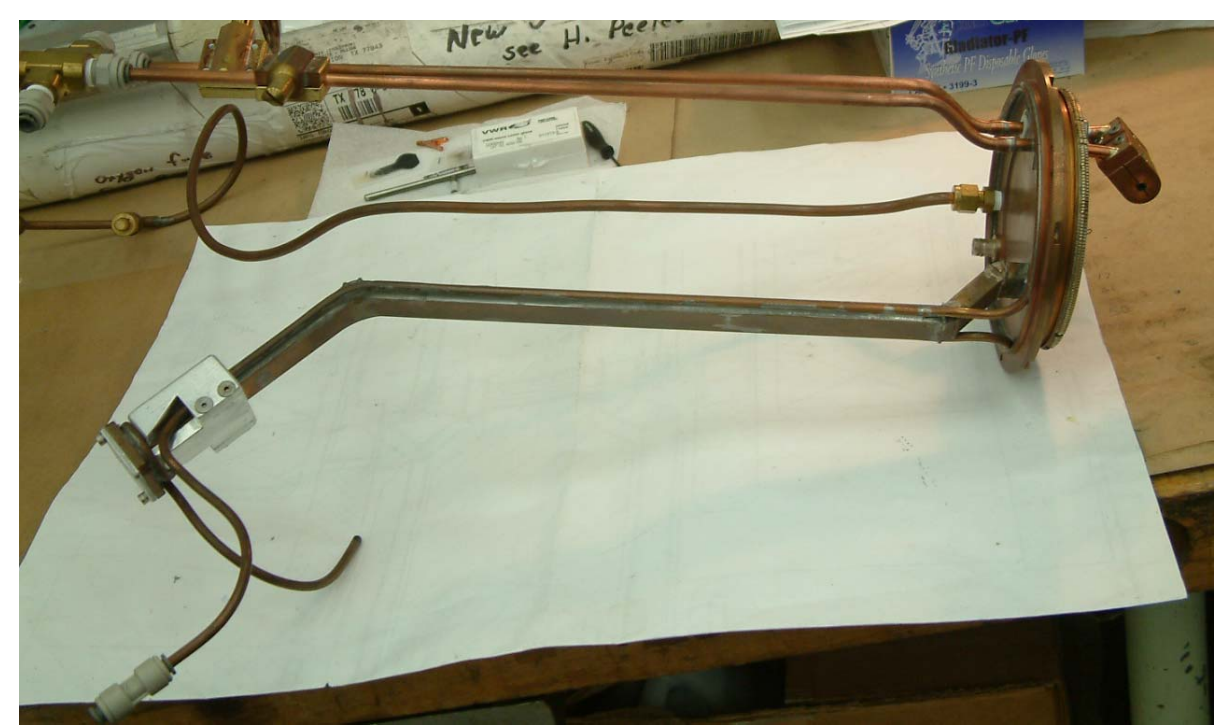
FIG. 1 . The modified injection plate for ECR2. The high-temperature oven is at the top. The clamps containing the crucible are at the right.

In order to satisfy the demand for K150 beams that are most easily produced using a hightemperature oven with the ECR2 ion source, an axially-mounted oven was designed, constructed and tested off-line. It was decided to mount the oven axially because of the limited space available for radial insertion. Axial insertion limits the source to only one microwave injection port, and so the old singlefrequency injection flange was modified to accommodate the new oven (Fig. 1). Unfortunately, this means that two-frequency injection cannot be used with the oven mounted and that the axial steel plug must be removed when the oven is mounted or dismounted.