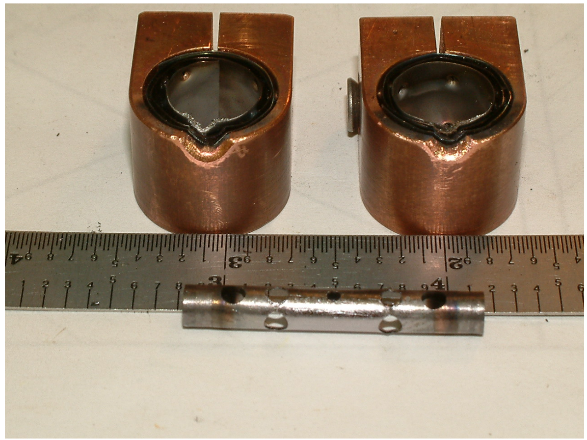
FIG. 2. The copper clamps and the detached, tantalum crucible.

A vacuum-chamber test stand was constructed to try out different crucible configurations. The crucible was fabricated from a 3/16" diameter, 0.0015" wall tantalum tube with tantalum plugs. After testing several configurations of the crucible, four 1/8" diameter holes were drilled into each end of the crucible outside of the plugs in an effort to concentrate the heat flow in the center. Vapor escapes from a 1/16" diameter hole drilled in the middle. Titanium was loaded into the crucible for a testing. Fig. 3 shows results from a successful test. A thin film of titanium was deposited onto a glass slide placed at the vapor outlet of the oven. Titanium was observed to be depositing when the current reached 110 amperes at 1.2 volts. The power supply was voltage controlled. As the oven heated up and evaporated more titanium, the power supply voltage was gradually raised to 1.4 volts in order to maintain a current of 100 amperes. The oven continued to produce vapor for a week. After these tests no evidence of heating the walls of the vacuum chamber was observed, a critical aspect in considering possible heat-damage to the permanent magnets in the ECR2 ion source.